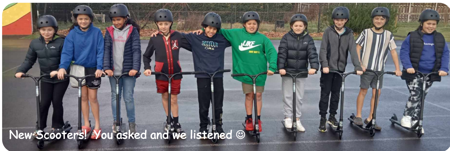
New Scooters! You asked and we listened ©