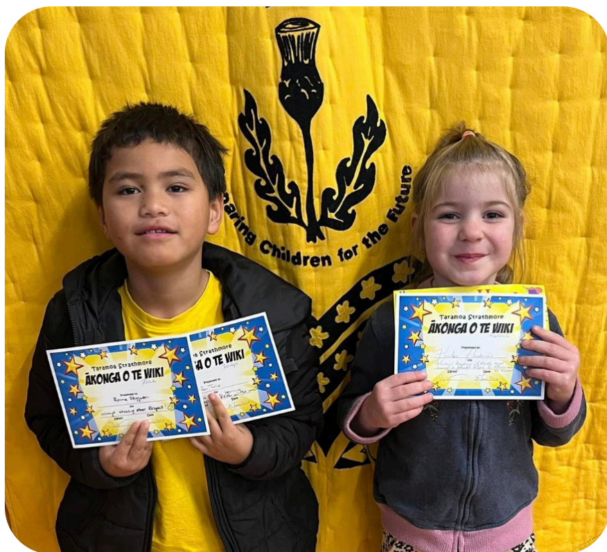
Taramoa Strathmore: Growing champions!