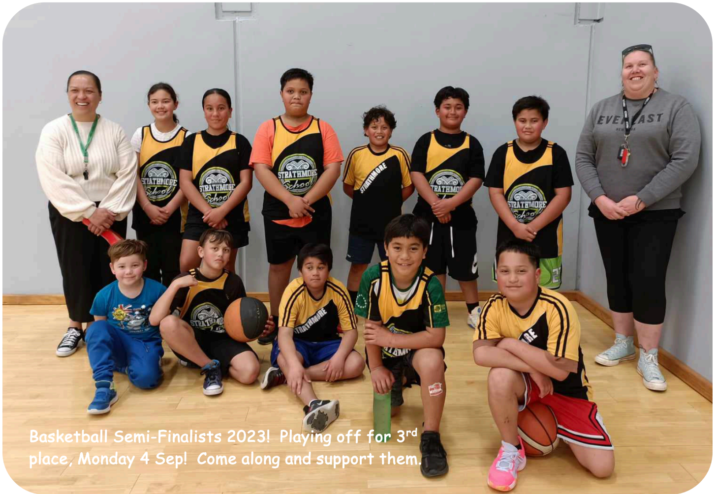
Basketball Semi-Finalists 2023! Playing off for 3 rd place, Monday 4 Sep! Come along and support them.