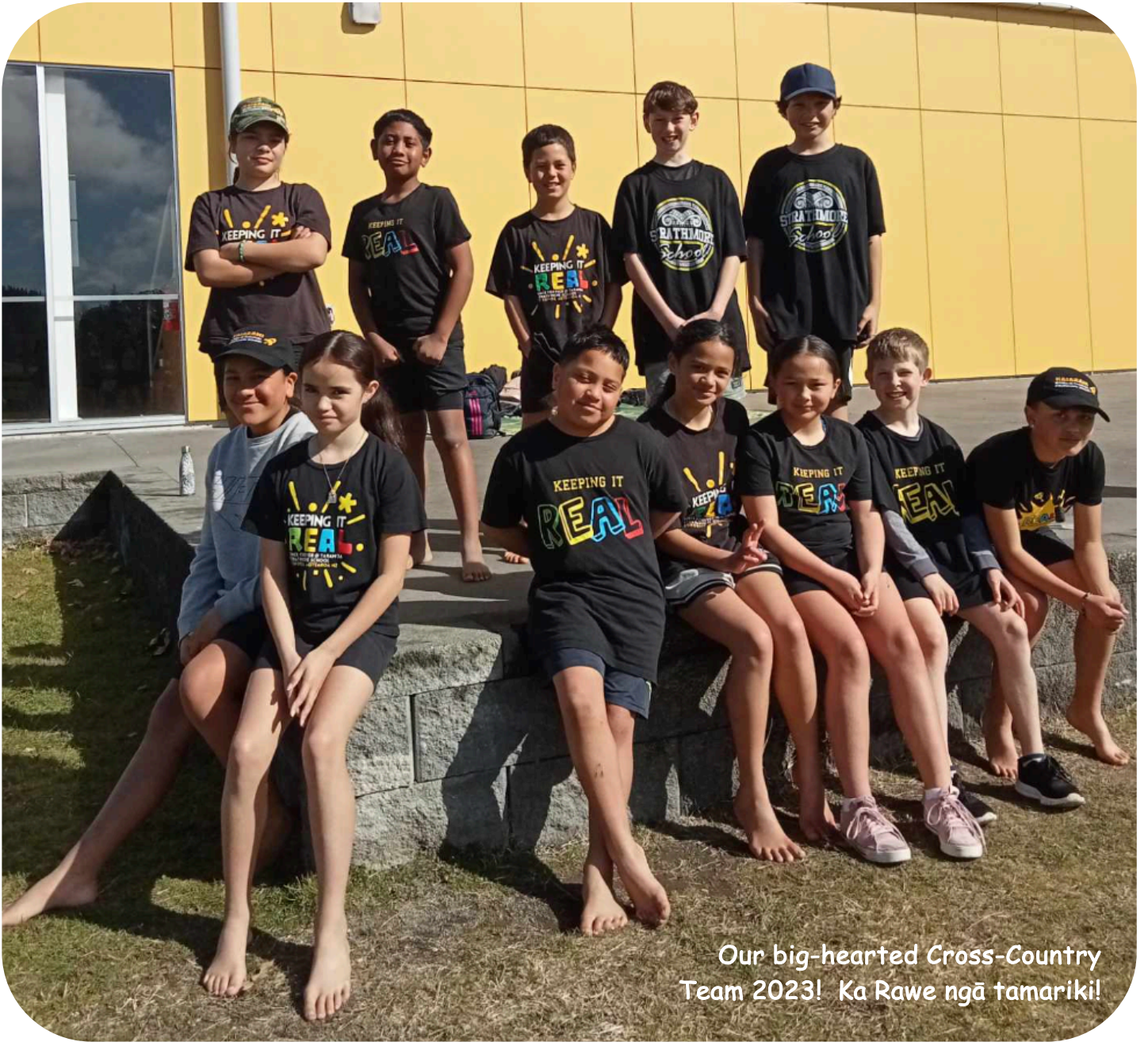
Our big-hearted Cross-Country Team 2023! Ka Rawe ngā tamariki!