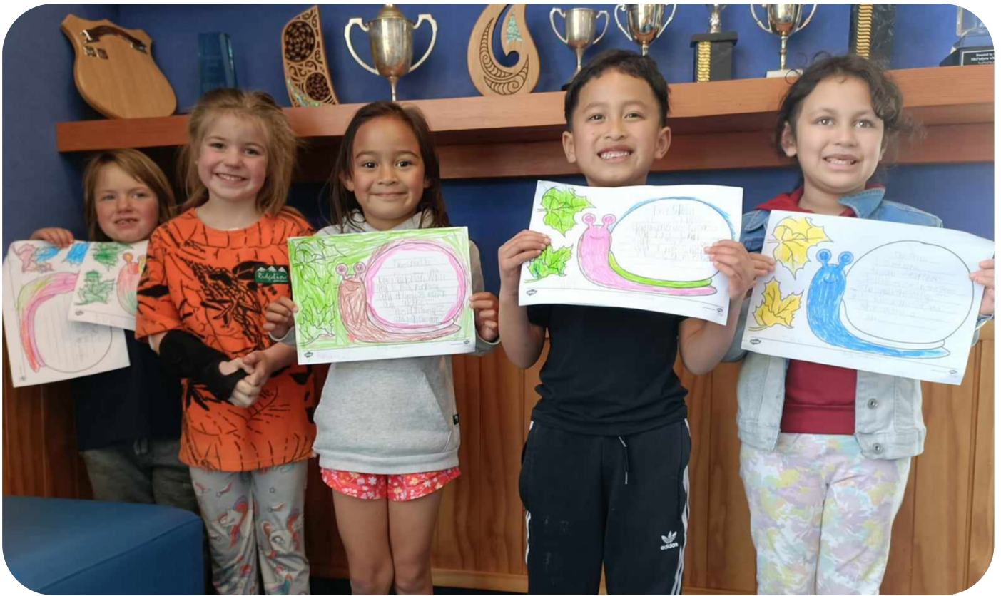
Art and writing, in class and outside on our new scribe boards.