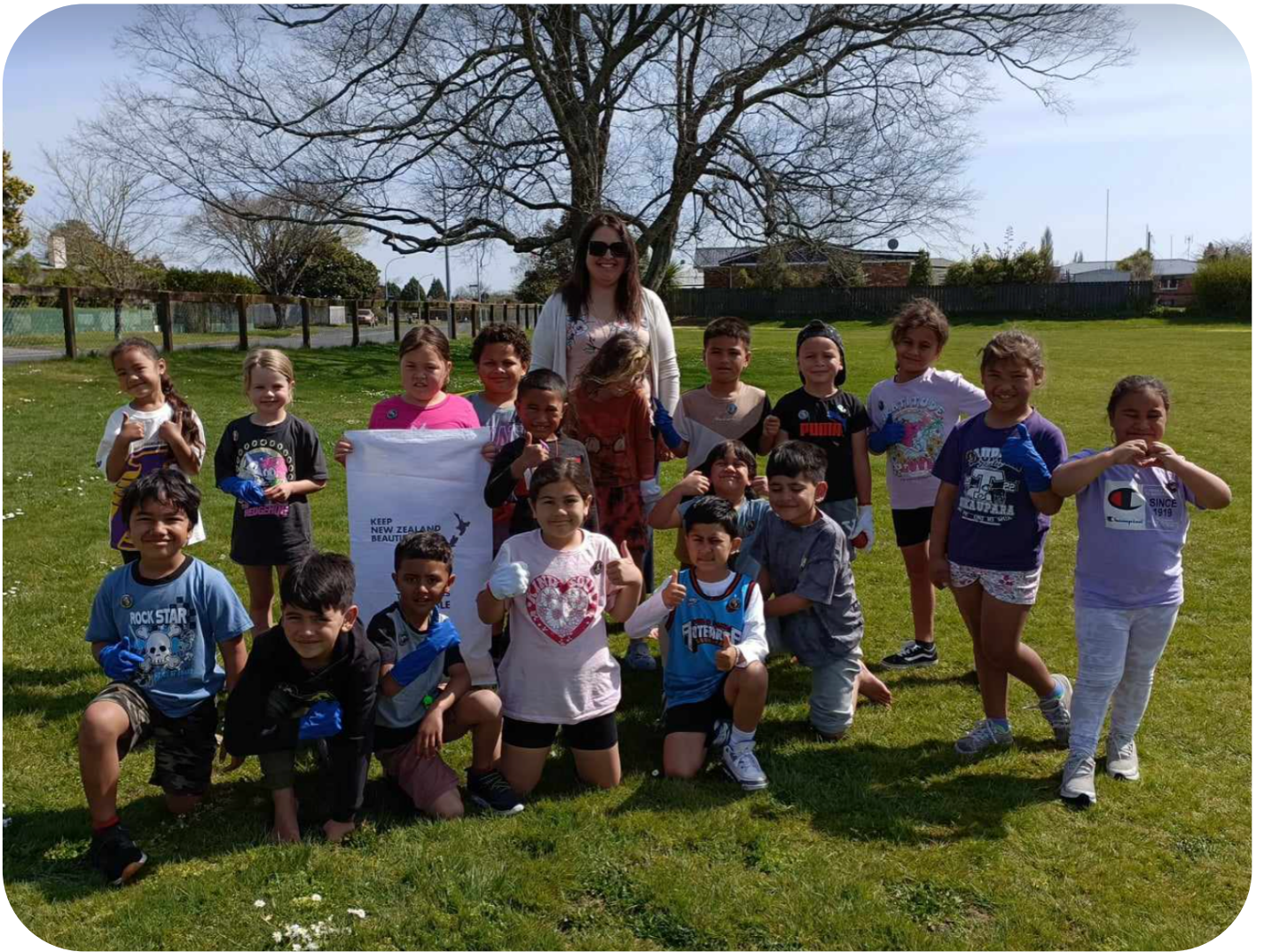
We are an EnviroSchool, and because we care about the environment, we got involved in Clean Up Aotearoa Day 2023.