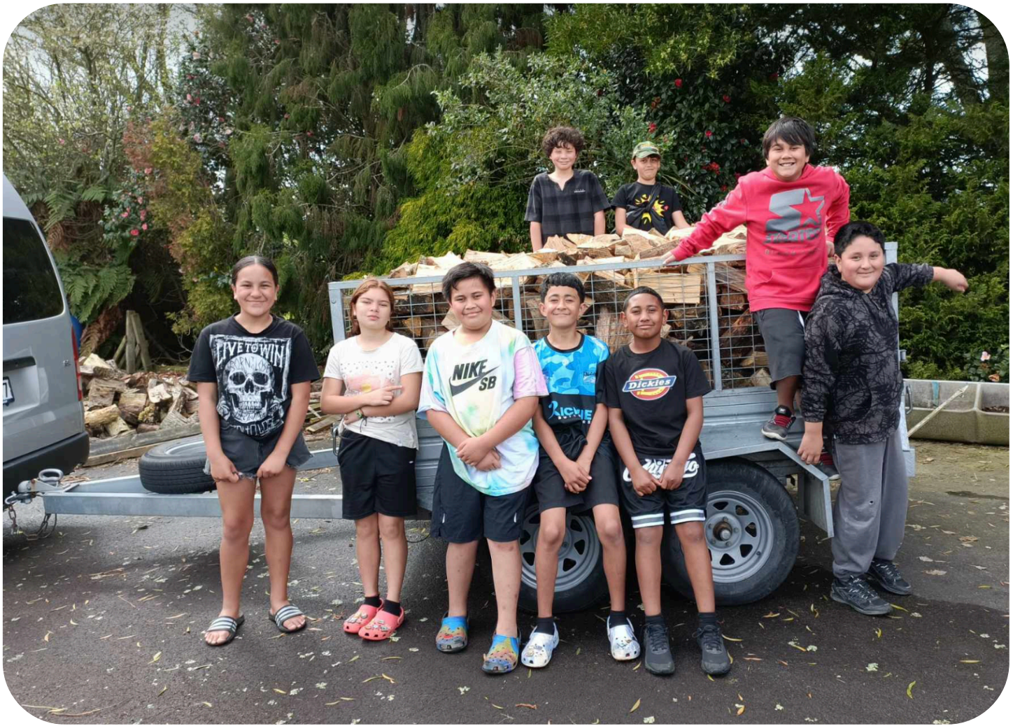
Our YR5-6 tamariki unloading the firewood raffle for the winners. Ka rawe!