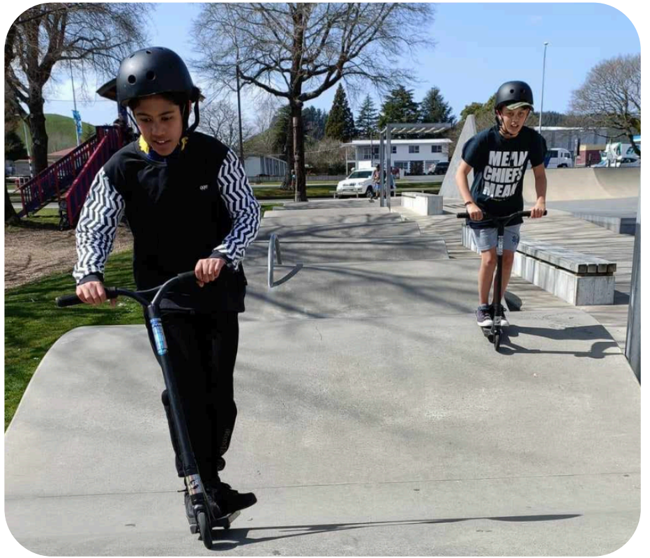
At Taramoa Strathmore School, every day is Pink Shirt Day!