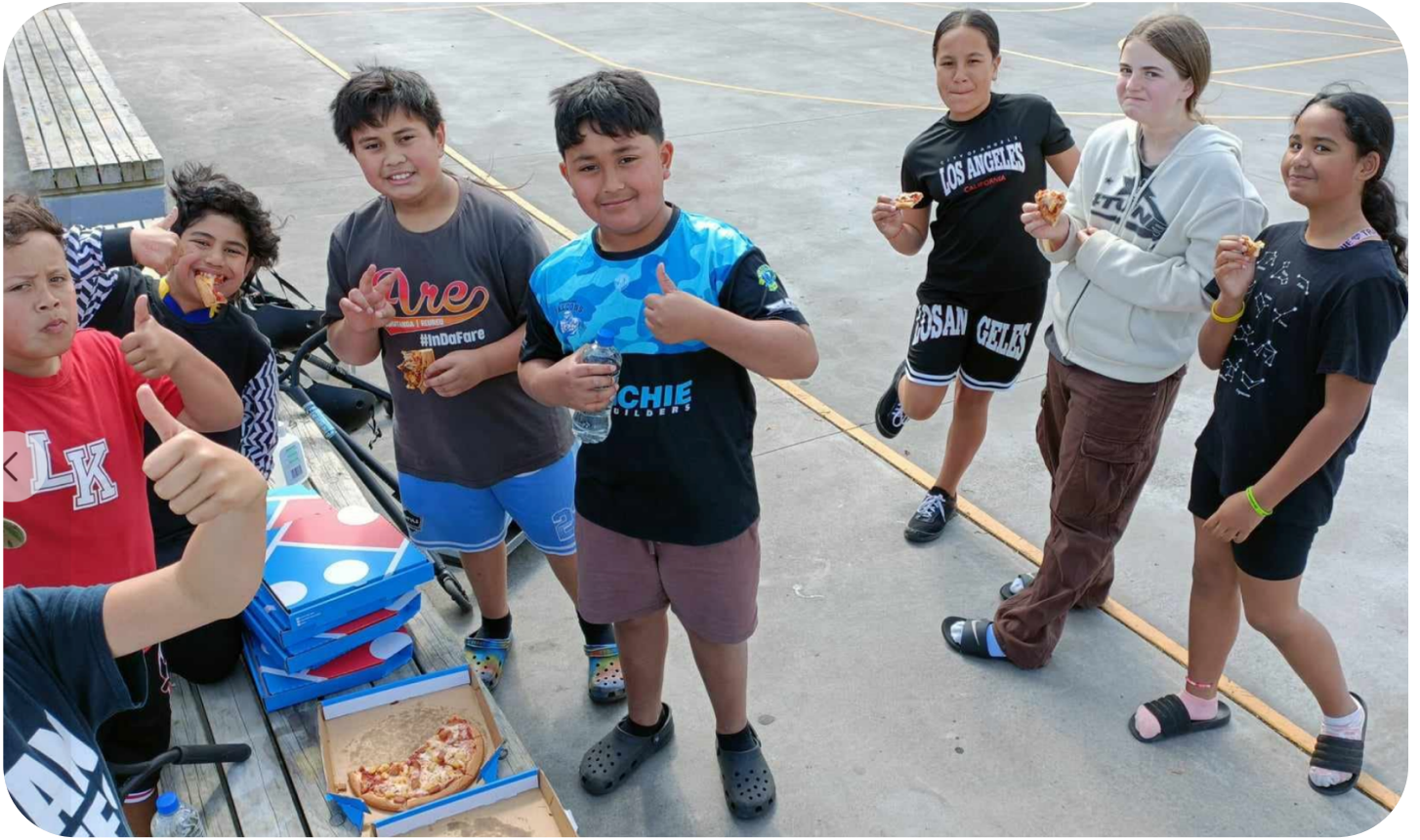
Lunching with the Principal ~ Pizza in the Park! Rewards for Keeping it REAL!