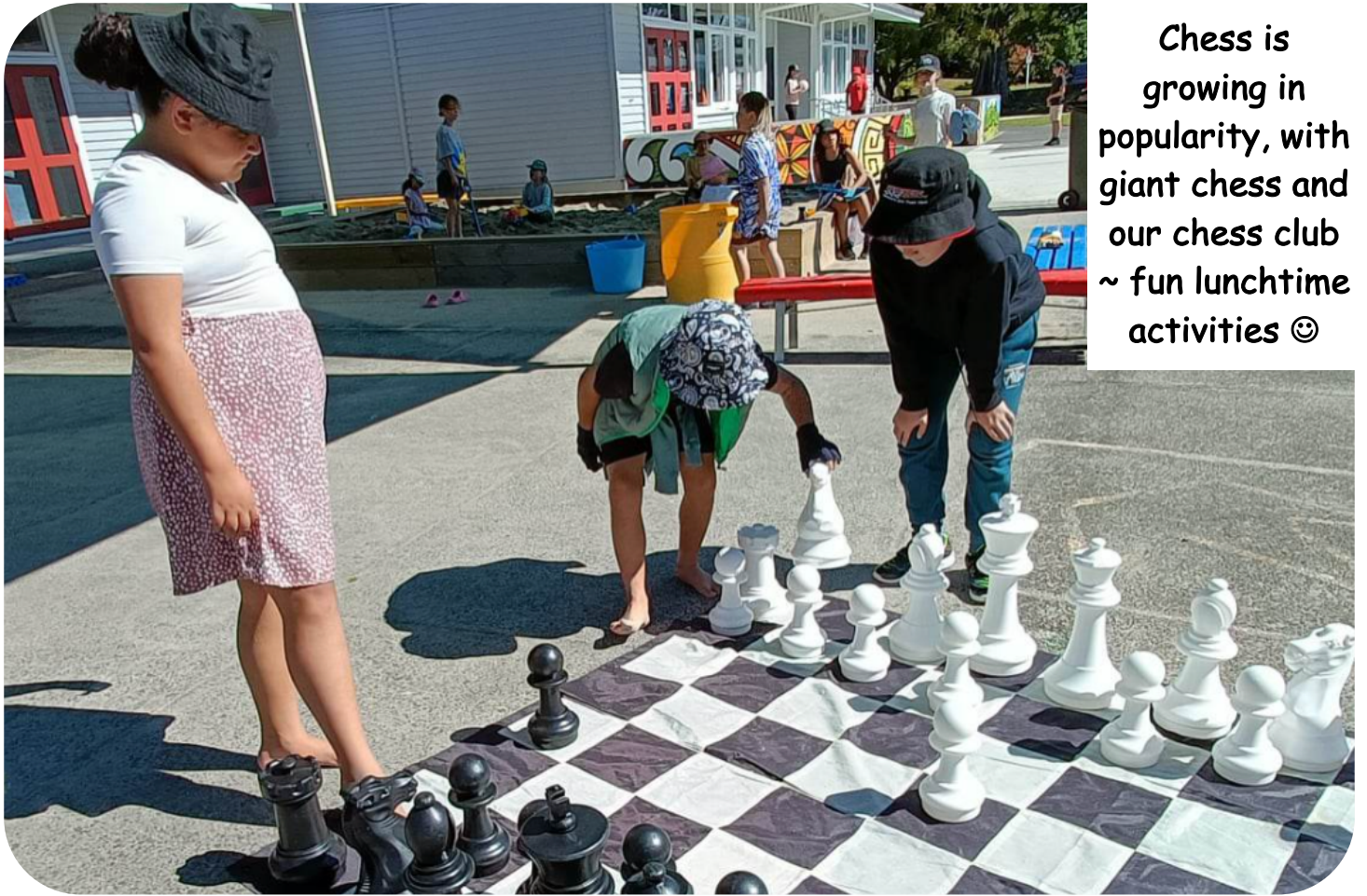
Chess is growing in popularity, with giant chess and our chess club ~ fun lunchtime activities ☺