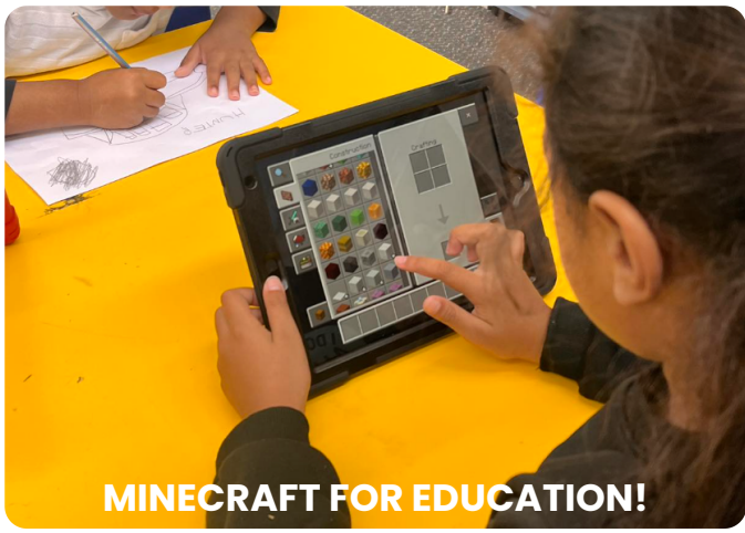
MINECRAFT FOR EDUCATION!